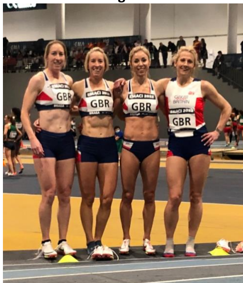
The GBR W40 4x200m Team